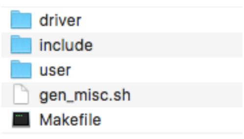
Figure 2-1. IoT_Demo folder

The structure of ESP8266_NONOS_SDK\examples\loT_Demo is as Figure 2-1.